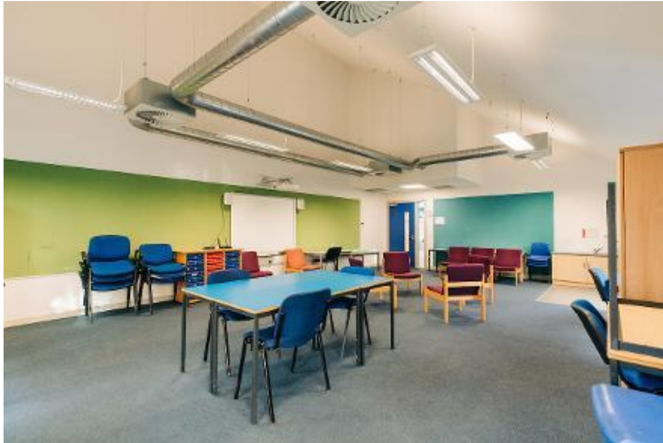
Anchor East 1 & 2 – Workshop venues. Each of the two rooms measures 60m 2 and has a maximum capacity of 30.