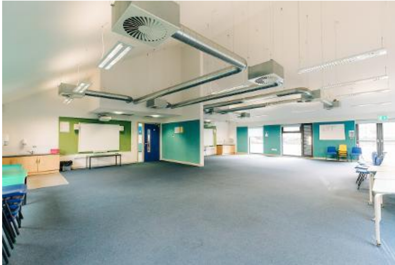
Anchor West – Workshop & presentation venue. The room measures 120m 2 and has a maximum capacity of 80.