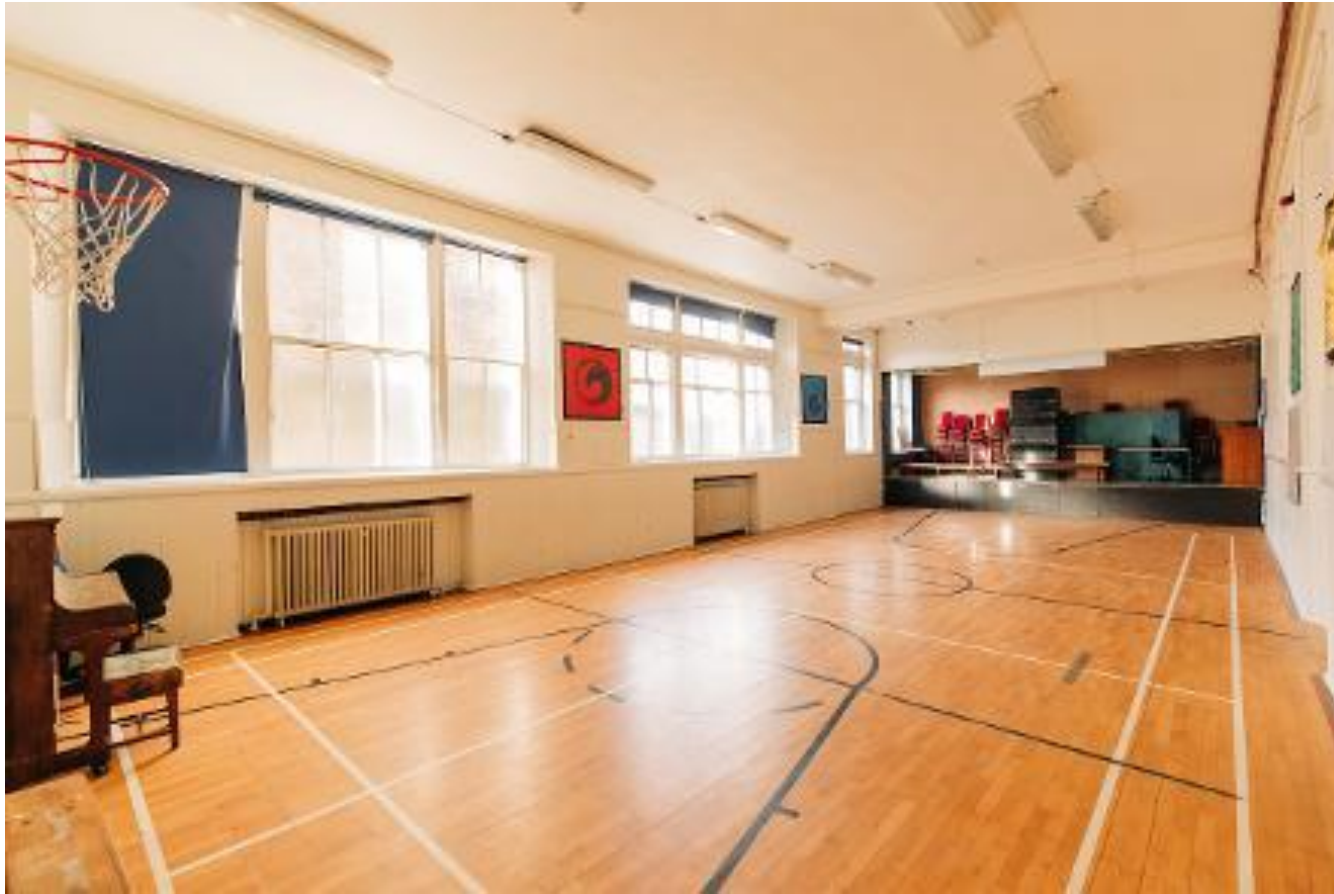
Victoria Hall – Concert & Saturday Evening Session venue